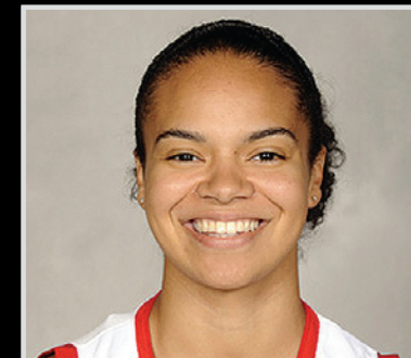
KRISTI TOLIVER, WNBA

Toliver, a two-time PGC grad, won an NCAA Championship at the University of Maryland in 2006 and was the 3rd Overall Pick in the 2009 WNBA Draft.